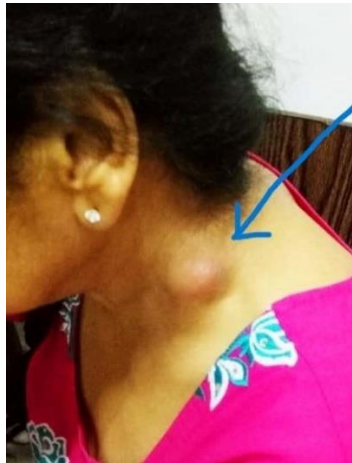
Fig. 1. Supraclavicular swelling on the left side of the base of the neck.

complaining of swelling over the left supraclavicular region (Fig. 1).