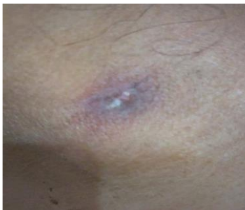
Fig. 3. Healed lesion after antitubercular drug regimen.

During the treatment, the swelling gradually shrank (Fig. 3).