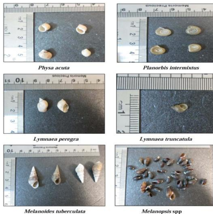
Fig. 2. Snails of Gahar Lake in Lorestan Province