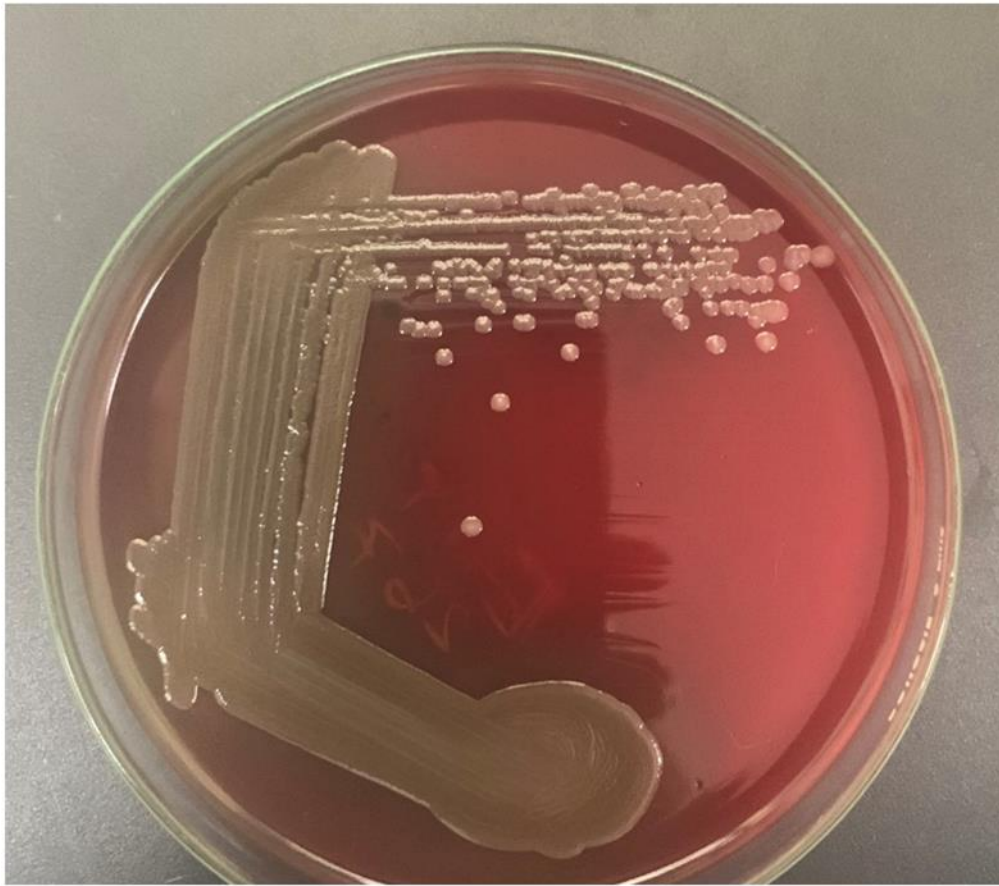
Fig. 1. Characteristic lavender-green colonies of S. maltophilia on blood agar