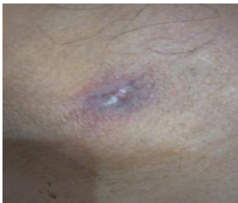
Fig. 3. Healed lesion after antitubercular drug regimen.

During the treatment, the swelling gradually shrank (Fig. 3).