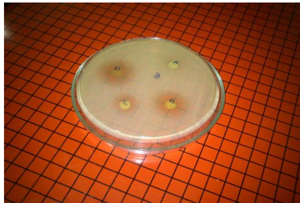
Fig. 3. Inhibitory effect of four tea extracts (A: red tea, B: green tea, C: black tea and D: white tea) on one of the tested microbes ( S. pneumoniae )