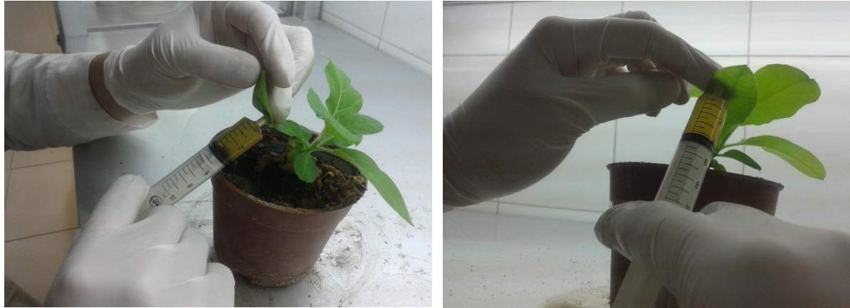
Fig 3. Agroinfiltration through syringe infiltration of N. tabacum leaves (Habibi-Pirkoohi et al. 2014)

influenza vaccines in a reasonably short time [20]. Habibi-Pirkoohi et al. (2014) expressed VP1 epitopes of foot and mouth disease virus (FMDV) in tobacco ( N. tabacum ) and observed high levels of recombinant peptide accumulation in infiltrated leaves (Fig. 3a). They also examined the agroinfiltration technique to express the same construct in spinach [8] and alfalfa [21]. High levels of antigen expression were achieved in both experiments.