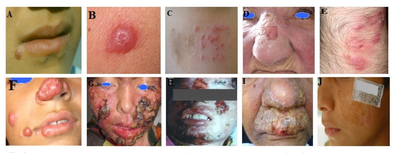
Fig. 2. Representative of skin lesions observed in cutaneous leishmaniasis patients in epidemic foci of Iran [53]: (A) An erythematous papule, (B) a nodule, (C) lupoid leishmaniasis, (D) an erysipeloid, (E) sporotrichoid, (F) diffuse cutaneous lesions, (G) disseminated cutaneous leishmaniasis, (H) multiple cutaneous ulcers, (I) ulcerated lesions with lymph edema, (J) a vast scar.

A significant risk factor in Orzoeihe district in the western province of Kerman, southeast of Iran, was established with the new water wells and electric pumps, which created new irrigation schemes and cultivation of new crops. This new agricultural project provoked a sharp change in the reproduction patterns of the main reservoir, i.e. , the gerbils [26,27]. A large area was cultivated with cucumbers, melons, and various other grain crops, which provided an extraordinarily suitable source of food for gerbils and breeding of vector for ZCL. Consequently, there was a sudden increase in the population of rodents and vectors, followed by an epidemic of ZCL in rural residential areas [26-28].