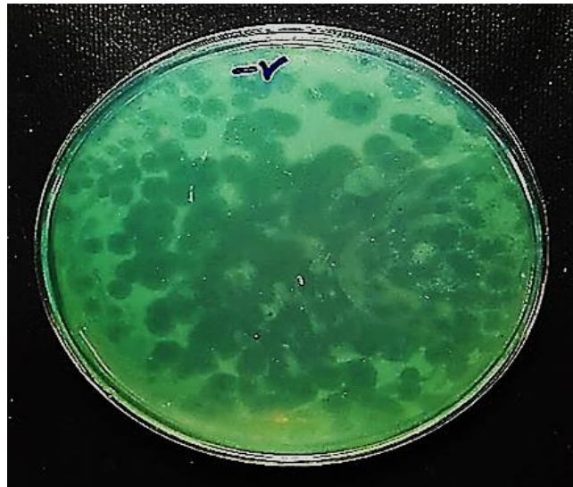
Fig. 1. DLA assay displaying plaques caused by phages in P. aeruginosa culture.