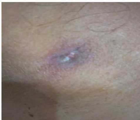
Fig. 3. Healed lesion after antitubercular drug regimen.

During the treatment, the swelling gradually shrank (Fig. 3).