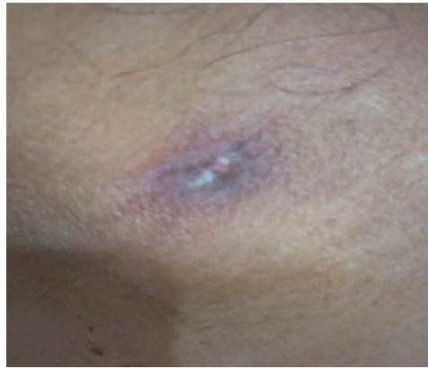
Fig. 3. Healed lesion after antitubercular drug regimen.

During the treatment, the swelling gradually shrank (Fig. 3).