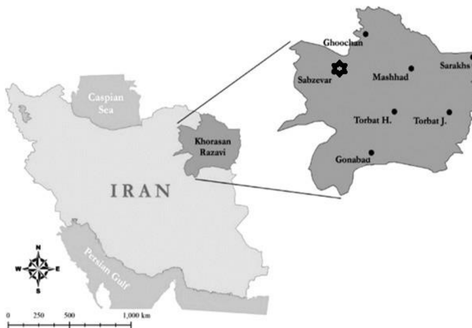
Fig 1. The location of Sabzevar city in the west of Khorasan Razavi province, Iran

57.68° E) (Fig. 1). The eastern and northern regions of this mountainous city are temperate and warm in the lowlands. The climate plays a vital role in pasture development and rearing of domestic animals such as poultries.