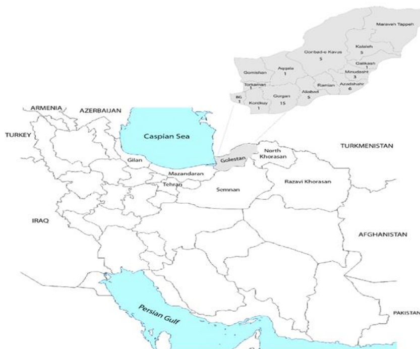
Fig 1. Map of Iran and the study area (Golestan province). The numbers indicate the patients in each county.

Clinical samples. Five ml of blood was obtained from 52 febrile patients residing in different counties of Golestan province (Fig. 1), from Jul. 2012 to Nov. 2013. The patients were referred to public health centers with fever and one other symptom, including headache and muscular pain. The samples were kept at 4°C, and then transferred to the Department of Parasitology, Pasteur Institute of Iran, within 4–7 days under a cold condition. The sera were separated after incubation at 4 °C for 24 h and used for different assays. Informed consent was obtained from all the adult participants, and the parents, or the children's legal guardians. The Ethical Committee of Research, Pasteur Institute of Iran reviewed and approved this study (Project No. 626).