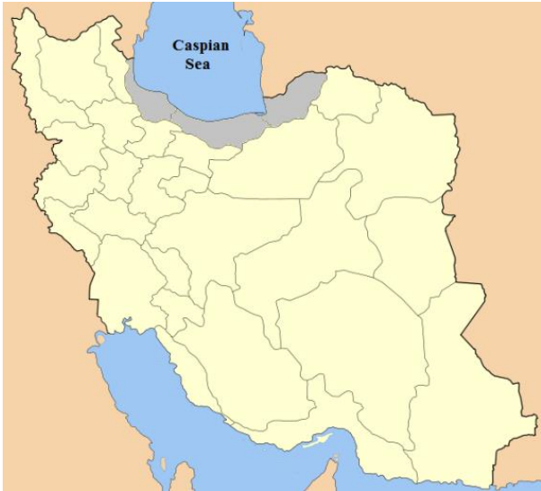
Fig. 1. Map of Iran, the study area in gray shows Gilan, Golestan, and Mazandaran Provinces

morphology and morphometric features reflected in the valid taxonomic keys [16-18]. Also, the formalin-ether sedimentation technique was performed on intestinal contents, and wet smears were prepared and examined for the presence of helminths egg under a light microscope with magnifications 100X to 400X.