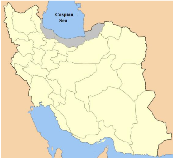
Fig. 1. Map of Iran, the study area in gray shows Gilan, Golestan, and Mazandaran Provinces

morphology and morphometric features reflected in the valid taxonomic keys [16-18]. Also, the formalin-ether sedimentation technique was performed on intestinal contents, and wet smears were prepared and examined for the presence of helminths egg under a light microscope with magnifications 100X to 400X.