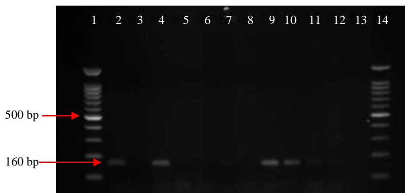
Fig. 2. Amplification of intI1 gene from A. baumannii isolates; Lane 1, 100 bp DNA ladder; lane 2, positive control; lane 3, negative control; lanes 4, 9, 10, positive isolates for intI1 ; lanes 5-8 and 11-13, negative isolates for intI1 ; lane 14, 100 bp DNA ladder