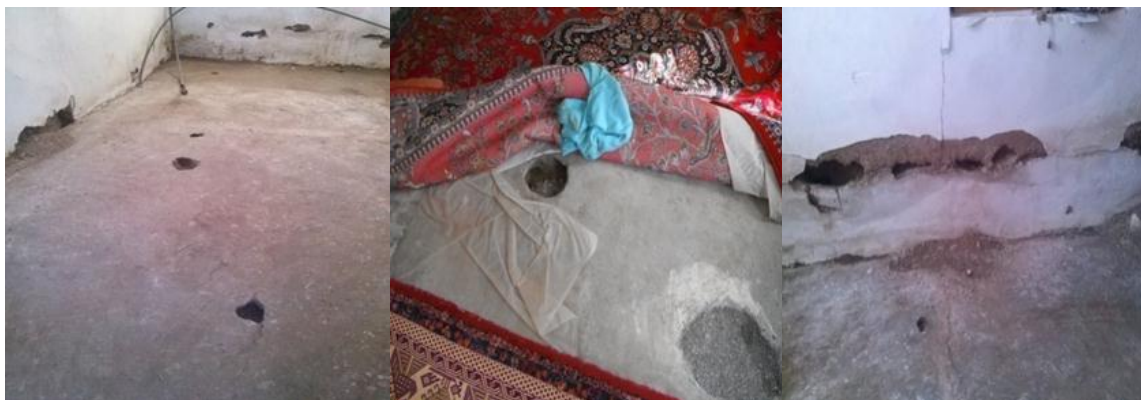
Fig. 2. Effects of rodent infestation to houses in Najaf Abad village; ruined floor of residential houses