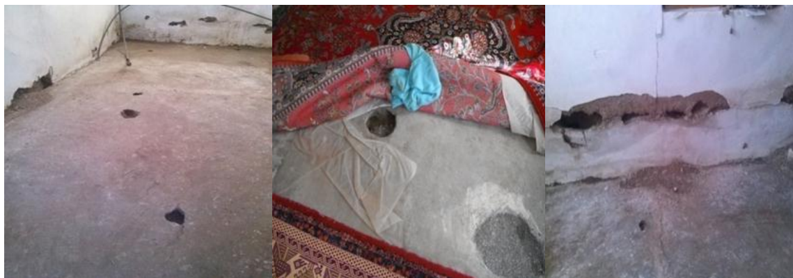
Fig. 2. Effects of rodent infestation to houses in Najaf Abad village; ruined floor of residential houses