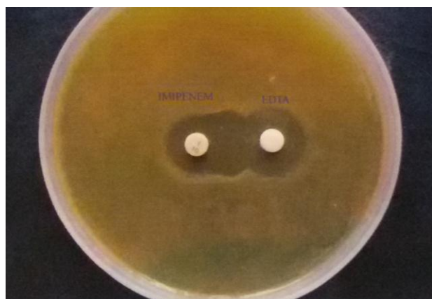
Fig. 2. Impipenem-EDTA Double synergy test of P. putida